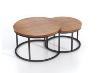
BT007-SD3 53.05 USD

The top is made from standard compact, thickness 12mm. The edge is painted with color same as the top. The leg is steel with powder coating.