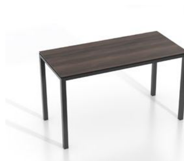
BNT002-SD1 85.58 USD R : 1200 x S : 600 x C : 750 The top is made from anti-UV compact that using for outdoor furniture, thickness 12mm. The leg is steel with powder coating.