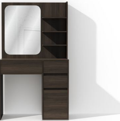
BP010-GD3 154.55 USD GP010-GD 14.85 USD

R : 1000 x S : 600 x C : 1470 R : 450 x S : 350 x C : 420