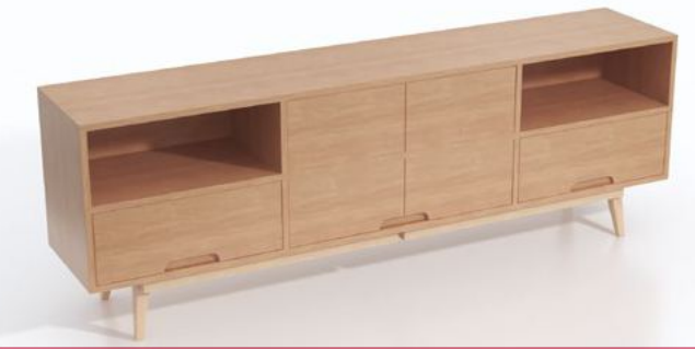
KTV006-GD5 215.73 USD R : 1850 x S : 400 x C : 595

The top is made from moisture resistant MDF, Glue E1, covered with anti-bacterial Laminate of Japan Aica. The box is made of moisture resistant MDF, covered with melamine that has the same color as Laminate. The edge is banded with ABS. The leg is solid wood with PU paint. Hafele hardware.