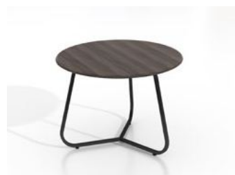
BT005-SD4 26.52 USD

The top of table is J-top. The table leg is steel with powder coating.