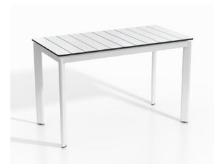
BNT004-SNCPN 85.58 USD R : 1200 x S : 600 x C : 750 The top is made from anti-UV compact that using for outdoor furniture, thickness 12mm. The leg is steel with powder coating.