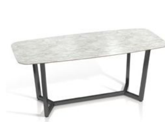
BT001-GCP 103.62 USD

The table top is black tempered glass, thickness 10mm. The body is made of moisture resistant MDF, Glue E1, covered with Japan Aica Laminate. The edge is beveled, painted with the same color as the body.