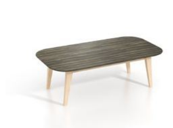
BT019-SD3 58.35 USD

The top is made from moisture resistant MDF, Glue E1, covered with anti-bacterial Laminate of Japan Aica. The body is MFC with the same color. The edge is banded with ABS. The leg is steel with powder coating.