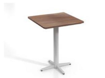
BT006-SCP 40.67 USD

The top of table is J-top. The table leg is steel with powder coating.