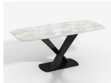
BA007-SD3 302.02 USD 2400 x S : 1200 x C : 755

The top is made from moisture resistant MDF, Glue E1, covered with mirror-glossy anti-scratch Laminate. The edge is 45 degrees beveled, surface treatment and varnish. The leg is steel with powder coating.