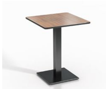
BNT001-ID2 77.10 USD R : 600 x S : 600 x C : 750 The top is made from moisture resistant MDF, Glue E1, both sides are covered with Japan Aica Laminate - yellow core (non curved). The edge is 45 degrees beveled, surface treatment and varnish. The leg is SUS 304