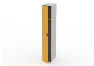
TLK002-CPL 151.36 USD

The locker cabinet is made from compact 12mm, linked by lamelo, SUS 304 accessories. Excluded the lock.