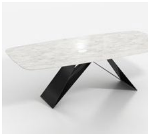
BA008-SD3 298.13 USD 2400 x S : 1200 x C : 755

The top is made from moisture resistant MDF, Glue E1, covered with anti-bacterial Laminate of Japan Aica. The edge is 45 degrees beveled, painted with solid color same as the top. The leg is steel with powder coating.