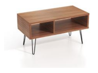
BT018-SD3 90.18 USD

The top is made from moisture resistant MDF, Glue E1, covered with anti-bacterial Laminate of Japan Aica. The edge is banded with ABS. The leg is steel with powder coating.