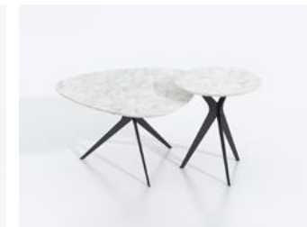
BT012-SD3 52.34 USD

The top is made from moisture resistant MDF, Glue E1, covered with anti-bacterial Laminate of Japan Aica. The edge is banded with ABS. The leg is steel with powder coating.