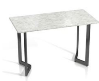
BA005-SD4 71.44 USD R : 1200 x S : 600 x C : 750

The top of table is J-top. The table leg is steel with powder coating.