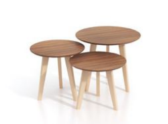
BT023-GD3 88.06 USD

The top is made from moisture resistant MDF, Glue E1, covered with anti-bacterial Laminate of Japan Aica. The edge is 45 degrees beveled, surface treatment and painted with solid color same as the top. The leg is solid wood with PU paint.