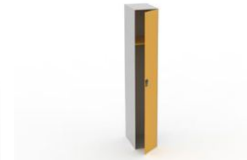
TLK008-CPL 151.36 USD

The locker cabinet is made from compact 12mm, linked by lamelo, SUS 304 accessories. Excluded the lock.