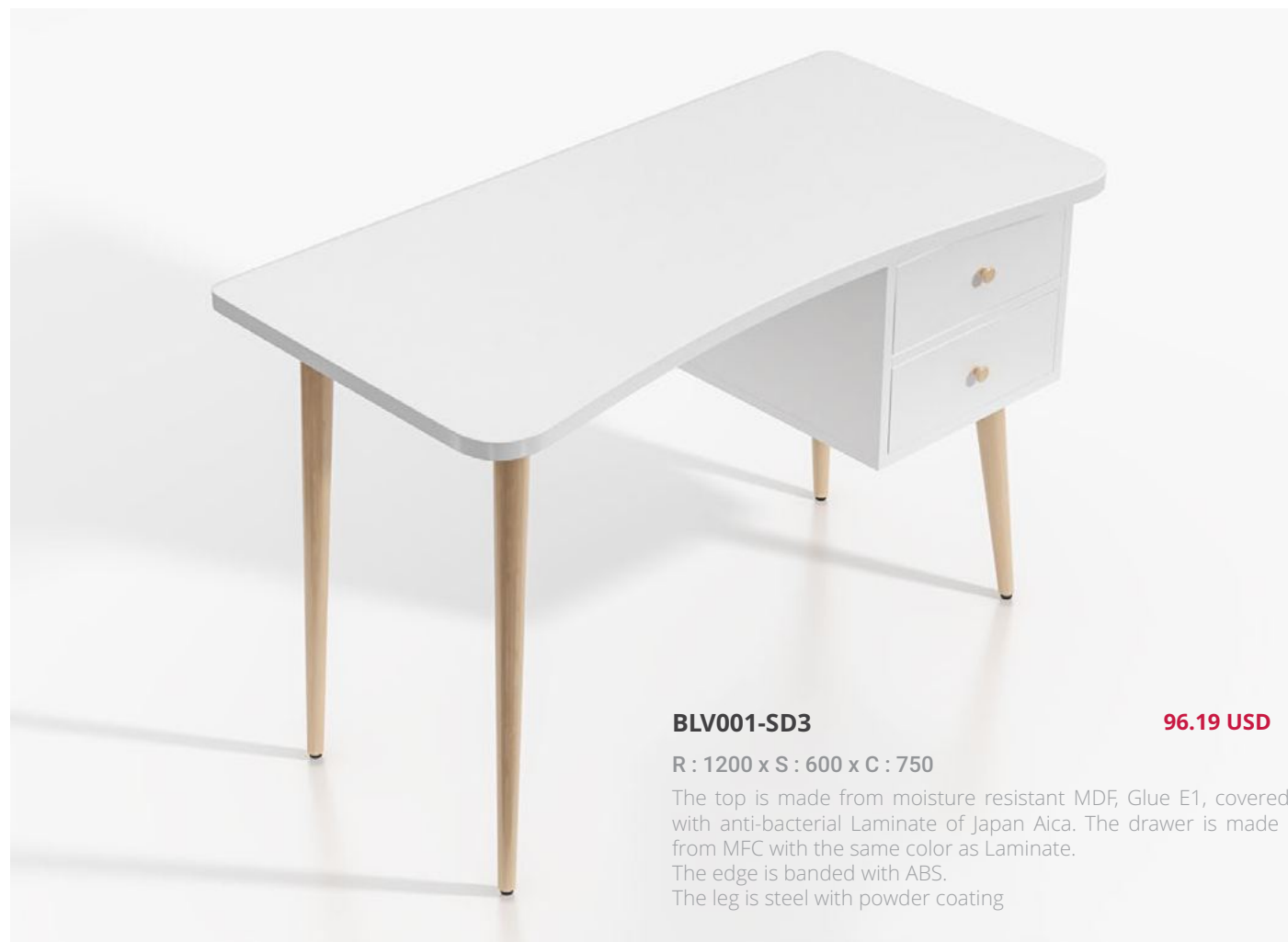
BLV001-SD3 96.19 USD R : 1200 x S : 600 x C : 750 The top is made from moisture resistant MDF, Glue E1, covered with anti-bacterial Laminate of Japan Aica. The drawer is made from MFC with the same color as Laminate. The edge is banded with ABS. The leg is steel with powder coating