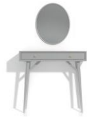
BP001-SD3 102.21 USD BP002-GD3 94.42 USD GP002-GD 12.73 USD BP003-GD3 110.34 USD

R : 800 x S : 400 x C : 750 R : 1000 x S : 500 x C : 750 R : 420 x S : 350 x C : 426 R : 696 x S : 600 x C : 1488,6