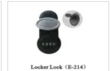
K008 6.01 USD