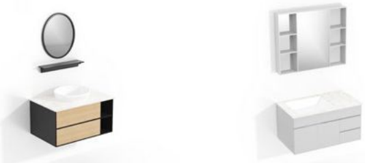
LV001-DCP1 200.17 USD LV002-DCP1 268.77 USD

R : 900 x S : 590 x C : 1495 R : 1000 x S : 590 x C : 1630