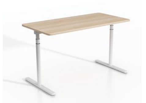
BCN001-SD3 469.65 USD

The top is made from moisture resistant MDF, Glue E1, covered with Japan Aica anti-bacterial laminate, ABS banding. The body is MFC with moisture resistant MDF for core. The leg is steel with powder coating.