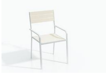
GA001-SCP 42.79 USD R : 532 x S : 544 x C : 890

The top is made from anti-UV compact that using for outdoor furniture, thickness 12mm. The edge is 45 degrees beveled, surface treatment and painted with the same color as the top. The leg is steel with powder coating.