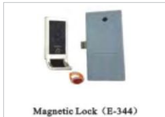
KT005 22.99 USD

Magnetic mix Electronic lock for locker cabinet