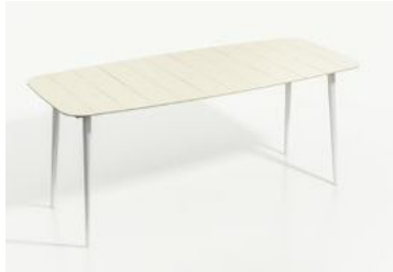
BA001-SCP 168.69 USD R : 1800 x S : 800 x C : 750

The top is made from anti-UV compact that using for outdoor furniture, thickness 12mm. The edge is 45 degrees beveled, surface treatment and painted with the same color as the top. The leg is steel with powder coating.