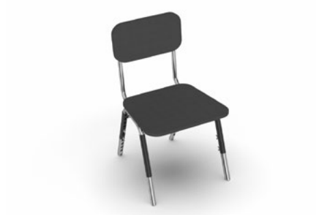
GSH001-IM5 16.27 USD

The top is made from moisture resistant MDF, Glue E1, covered with anti-bacterial laminate. All edges are round curved. There is plastic pen tray on the surface, wooden mix powder coated iron drawer in the chassis. The adjustable legs with SUS 304 and steel with powder coating.