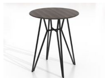
BT004-SJT 45.27 USD

The top of table is J-top. The table leg is steel with powder coating.