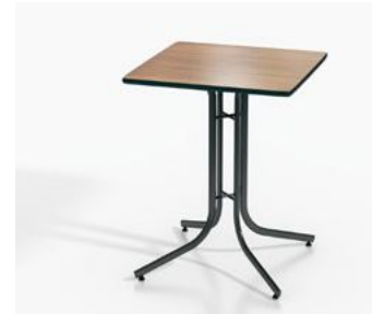
BNT002-SD2 51.99 USD R : 600 x S : 600 x C : 750 The top is made from moisture resistant MDF, Glue E1, both sides are covered with Japan Aica Laminate - yellow core (non curved). The edge is 45 degrees beveled, surface treatment and varnish. The leg is steel with powder coating.