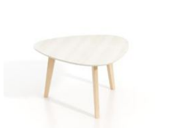
BT022-GD3 48.80 USD

The top is made from moisture resistant MDF, Glue E1, covered with anti-bacterial Laminate of Japan Aica. The edge is 45 degrees beveled, surface treatment and painted with solid color same as the top. The leg is solid wood with PU paint.