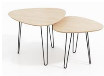
BT001-SD2 49.51 USD