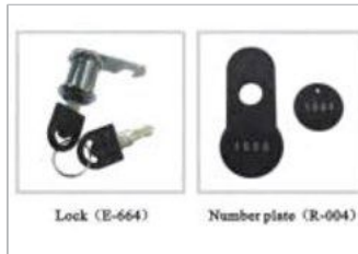
K001 2.12 USD

The lock for locker cabinet. There is number list attached