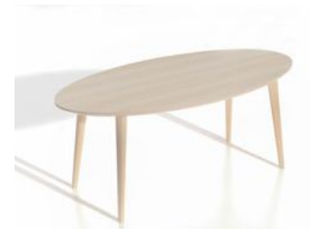
BD010-GD2 63.30 USD

The top is made from moisture resistant MDF, Glue E1, covered with anti-bacterial Laminate of Japan Aica. The edge is banded with ABS. The leg is steel with powder coating.