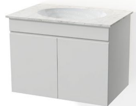
LV009-CP 163.74 USD

The top is made of stone grain compact. The edge is painted with solid color same as the top. The body of cabinet is made of compact, linked by lamelo cabineo. Silver-plated mirror, thicknees 5mm. Hafele accessories.