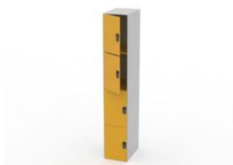
TLK005-CPL 169.75 USD

The locker cabinet is made from compact 12mm, linked by lamelo, SUS 304 accessories. Excluded the lock.