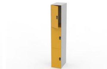
TLK004-CPL 161.26 USD

The locker cabinet is made from compact 12mm, linked by lamelo, SUS 304 accessories. Excluded the lock.