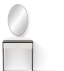
GP003-GD 12.73 USD BP004-GD3 134.39 USD GP004-GD 12.73 USD BP005-SD3 120.95 USD

R : 450 x S : 350 x C : 420 R : 770,5 x S : 770,5 x C : 1440 R : 450 x S : 350 x C : 420 R : 900 x S : 500 x C : 750