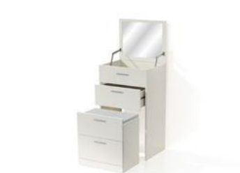
GP005-S 14.50 USD BP007-GD3 95.13 USD

R : 362 x S : 290 x C : 430 R : 486 x S : 510 x C : 1166