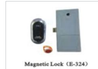
KT003 8.49 USD