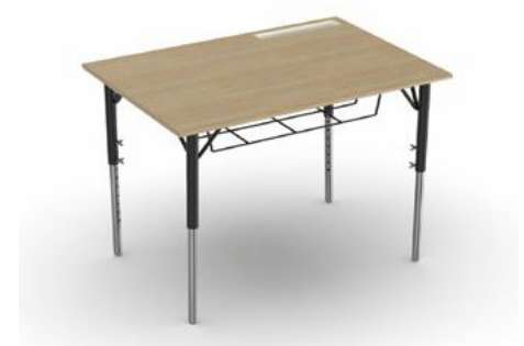
BHS009-IM5 48.10 USD