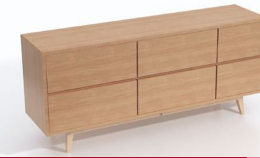
KTV005-GD5 217.50 USD R : 2000 x S : 400 x C : 690

The top is made from moisture resistant MDF, Glue E1, covered with anti-bacterial Laminate of Japan Aica. The box is made of moisture resistant MDF, covered with melamine that has the same color as Laminate. The edge is banded with ABS. The leg is solid wood with PU paint. Hafele hardware.