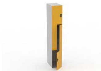
TLK001-CPL 166.92 USD