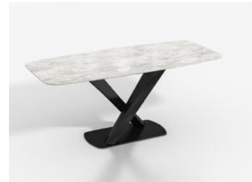
BA002-SD4 230.58 USD R : 1800 x S : 800 x C : 750

The top and body is made from standard compact, thickness 12mm. The frame is steel with powder coating.