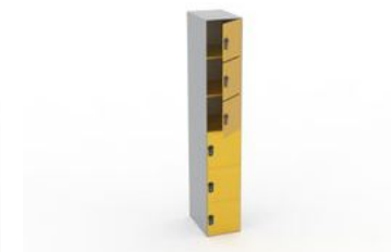
TLK012-CPL 191.68 USD

The locker cabinet is made from compact 12mm, linked by lamelo, SUS 304 accessories. Excluded the lock.