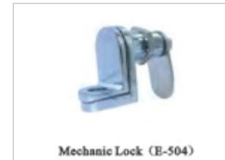
K007 3.54 USD