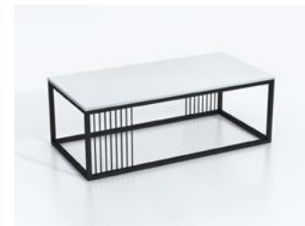
BT011-SD3 45.62 USD

The top is made from moisture resistant MDF, Glue E1, covered with Japan Aica Laminate - yellow core (non curved). The edge is 45 degrees beveled, surface treatment and varnish. The leg is solid wood with PU paint.