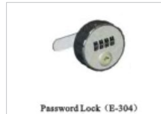
KS006 8.49 USD

Magnetic mix Electronic lock for locker cabinet