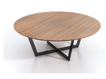
BT015-SD3 72.50 USD

The top is made from moisture resistant MDF, Glue E1, covered with anti-bacterial Laminate of Japan Aica. The edge is 45 degrees beveled, surface treatment and painted with solid color same as the top. The leg is steel with powder coating.