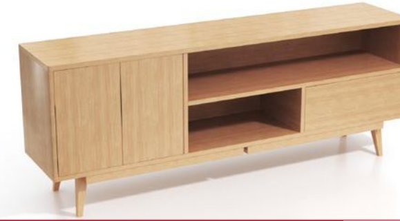
KTV002 - GD1 248.26 USD R : 1800 x S : 400 x C : 690

The core is made from moisture resistant MDF, Glue E1, covered with Japan Aica Laminate, double-sided curved. The top of cabinet is R9 curved, the drawer is made from MFC with the same color as Laminate, using Hafele hardware. The edge is banded with ABS. The leg is solid wood with PU paint.