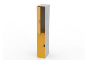
TLK003-CPL 153.13 USD

The locker cabinet is made from compact 12mm, linked by lamelo, SUS 304 accessories. Excluded the lock.