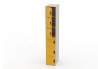
TLK006-CPL 191.68 USD

The locker cabinet is made from compact 12mm, linked by lamelo, SUS 304 accessories. Excluded the lock.