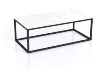
BT017-SD3 41.38 USD

The top is made from moisture resistant MDF, Glue E1, covered with anti-bacterial Laminate of Japan Aica. The edge is banded with ABS. The leg is steel with powder coating.