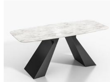
BA003-SD4 215.73 USD R : 1800 x S : 800 x C : 750

The top is made from moisture resistant MDF, Glue E1, covered with mirror-glossy anti-scratch Laminate. The edge is 45 degrees beveled, surface treatment and varnish. The leg is steel with powder coating.