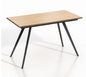
BA004-SJT 70.02 USD R : 1200 x S : 700 x C : 750

The top is made from moisture resistant MDF, Glue E1, covered with mirror-glossy anti-scratch Laminate. The edge is 45 degrees beveled, surface treatment and varnish. The leg is steel with powder coating.