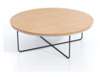
BT016-SD3 63.66 USD

The top is made from moisture resistant MDF, Glue E1, covered with anti-bacterial Laminate of Japan Aica. The edge is 45 degrees beveled, surface treatment and painted with solid color same as the top. The leg is steel with powder coating.