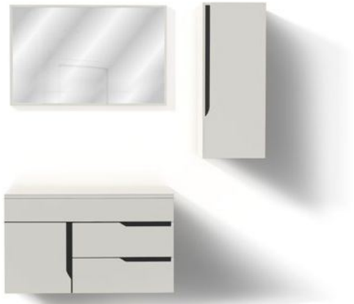
LV010-CP 408.11 USD

The top is made from stone grain compact. The edge is painted with solid color same as the top. The body of cabinet is made from moisture resistant MDF, Glue E1, covered with Japan Aica Laminate. Silver-plated mirror, thicknees 5mm Hafele accessories.