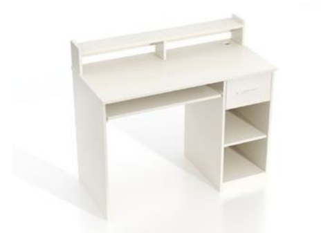
BHS003-GMA3 110.34 USD

The top is made from moisture resistant MDF, Glue E1, covered with Polyurethane cushion. The adjustable legs with SUS 304 and steel with powder coating