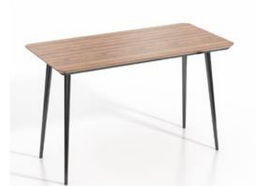
BA006-SD4 78.51 USD R : 1200 x S : 600 x C : 750

The top is made from moisture resistant MDF, Glue E1, covered with mirror-glossy anti-scratch Laminate. The edge is 45 degrees beveled, surface treatment and varnish. The leg is steel with powder coating.