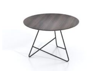
BT008-SCP 43.15 USD

The top is made from moisture resistant MDF, Glue E1, covered with anti-bacterial Laminate of Japan Aica. The edge is banded with ABS. The leg is steel with powder coating.