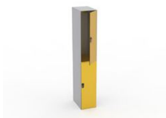
TLK009-CPL 153.13 USD

The locker cabinet is made from compact 12mm, linked by lamelo, SUS 304 accessories. Excluded the lock.