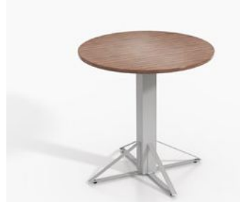
BD008-SD1 63.30 USD R : 915 x S : 915 x C : 750 The top of table is J-top, multidimensional curved Laminate. The pillar is solid wood with PU paint. The table leg is steel with powder coating