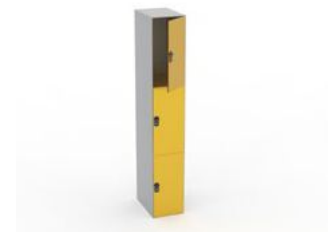
TLK010-CPL 161.26 USD

The locker cabinet is made from compact 12mm, linked by lamelo, SUS 304 accessories. Excluded the lock.