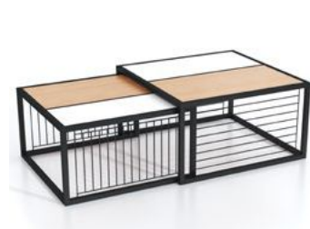
BT009-SD3 65.78 USD

The top is made from standard compact, thickness 12mm. The edge is painted with color same as the top. The leg is steel with powder coating.