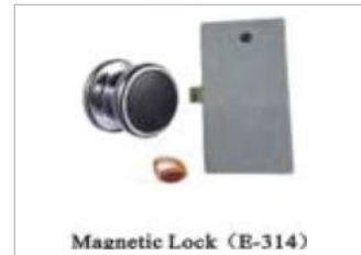
KT002 8.49 USD

The lock for locker cabinet. There is number list attached