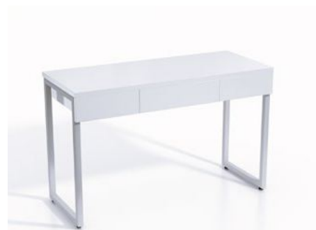
BLV002-SD3 73.21 USD R : 1200 x S : 500 x C : 750 The top is made from moisture resistant MDF, Glue E1, covered with anti-bacterial Laminate of Japan Aica. The drawer is made from MFC with the same color as Laminate. The edge is banded with ABS. The leg is steel with powder coating