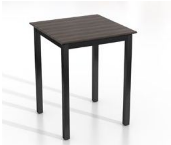
BD009-SCP 56.23 USD R : 600 x S : 600 x C : 750 The table top is made from standard compact, thickness 12mm. The edge is anti-sharp round-curved that is safety for the users. The table leg is steel with powder coating