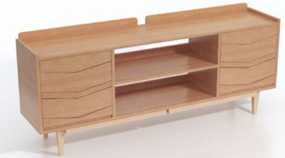
KTV004-GD5 257.10 USD R : 1600 x S : 400 x C : 690

The top is made from moisture resistant MDF, Glue E1, covered with anti-bacterial Laminate of Japan Aica. The box is made of moisture resistant MDF, covered with melamine that has the same color as Laminate. The edge is banded with ABS. The leg is solid wood with PU paint. Hafele hardware.