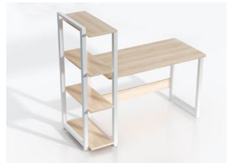
BHS004-SD3 83.82 USD

The top is made from moisture resistant MDF, Glue E1, covered with Japan Aica anti-bacterial laminate, ABS banding. The body is MFC with moisture resistant MDF for core.