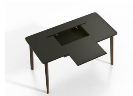
BLV003-SD4 198.75 USD R : 1400 x S : 700 x C : 750 The top is made from moisture resistant MDF, Glue E1, covered with Veltouch Laminate of Japan Aica. There is an electric box inside. The edge is banded with ABS. The leg is steel with powder coating