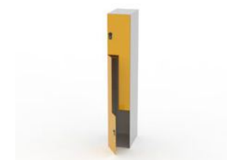
TLK007-CPL 166.92 USD

The locker cabinet is made from compact 12mm, linked by lamelo, SUS 304 accessories. Excluded the lock.