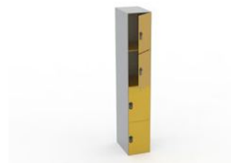
TLK011-CPL 169.75 USD

The locker cabinet is made from compact 12mm, linked by lamelo, SUS 304 accessories. Excluded the lock.