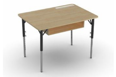
BHS0010-IM5 47.39 USD

The top is made from moisture resistant MDF, Glue E1, covered with anti-bacterial laminate. The long edges are curved. There is plastic pen tray on the surface, wooden mix powder coated iron drawer in the chassis. The adjustable legs with SUS 304 and steel with powder coating.