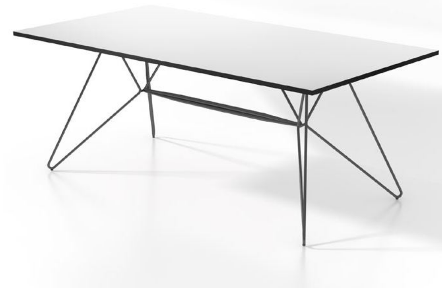
BNT006-SNCPN 91.95 USD R : 1200 x S : 700 x C : 750 The top is made from anti-UV compact that using for outdoor furniture, thickness 12mm. The leg is steel with powder coating.