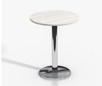
BD007-SD1 54.46 USD R : 600 x S : 600 x C : 750 The top of table is J-top, multidimensional curved Laminate. The table leg is steel with powder coating