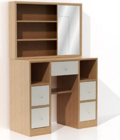
BP009-GD3 183.54 USD GP009-GD 15.56 USD

R : 1200 x S : 600 x C : 1470 R : 450 x S : 350 x C : 420