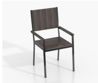
GD009-SCP 36.43 USD R : 532 x S : 550 x C : 932 The top is made from standard compact, 12mm thickness. The edge is anti-sharp round-curved that is safety for the users. The table leg is steel with powder coating