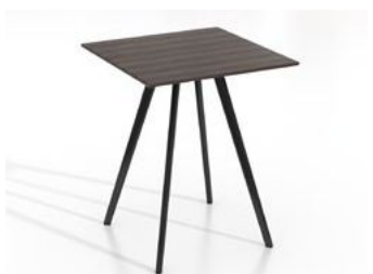
BT003-SJT 50.93 USD

The top is made from moisture resistant MDF, Glue E1, covered with anti-bacterial Laminate of Japan Aica. The edge is 45 degrees beveled, surface treatment and varnish. The leg is steel with powder coating.