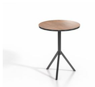
BNT005-SNCPN 33.95 USD R : 600 x S : 600 x C : 750 The top is made from anti-UV compact that using for outdoor furniture, thickness 12mm. The leg is steel with powder coating.