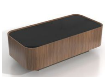
BT001-GD1 198.40 USD

The top is made from moisture resistant MDF, Glue E1, covered with Japan Aica Laminate - yellow core (non curved). The edge is 45 degrees beveled, surface treatment and varnish. The leg steel with powder coating.