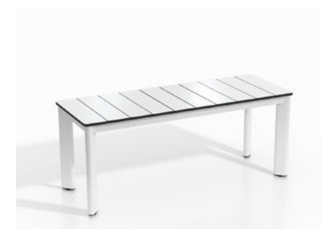
GNT004-SNCPN 48.45 USD R : 1090 x S : 400 x C : 450 The top is made from anti-UV compact that using for outdoor furniture, thickness 12mm. The leg is steel with powder coating.