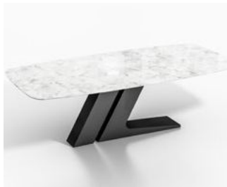
BA009-SD3 315.46 USD 2400 x S : 1200 x C : 755

The top is made from moisture resistant MDF, Glue E1, covered with anti-bacterial Laminate of Japan Aica. The edge is 45 degrees beveled, painted with solid color same as the top. The leg is steel with powder coating.