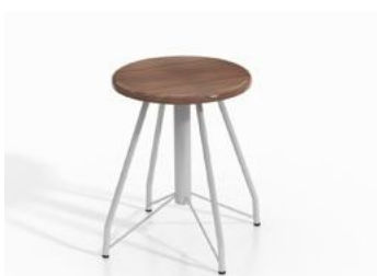
GT006-SCP 14.50 USD

The top is made from standard compact, thickness 12mm. The edge is painted with color same as the top. The leg is steel with powder coating.