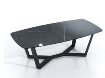
BT002-SD4 74.62 USD

The top is made from standard compact, thickness 12mm. The edge is 45 degrees beveled, surface treatment and painted with color same as the top. The leg is solid wood with PU paint.