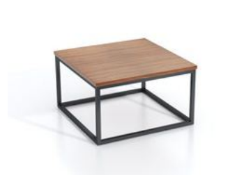
BT010-SD3 33.60 USD