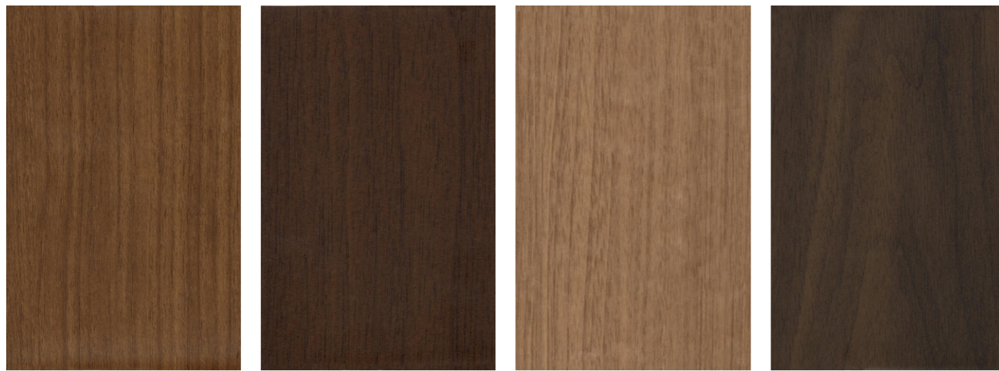
N102-000063 1220 x 2440 LAMINATE AS14093CT98 N102-000064 1220 x 2440 LAMINATE AS14007CT98 N102-000065 1220 x 2440 LAMINATE AS14015CS98 N102-000066 1220 x 2440 LAMINATE AS14095CS98