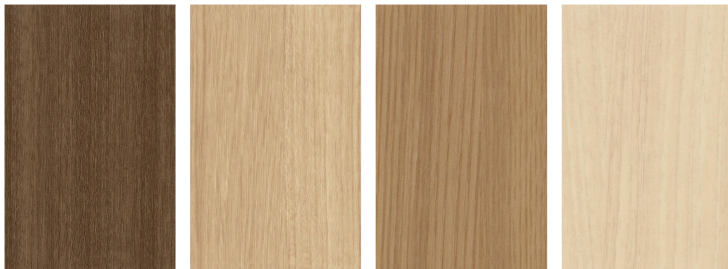
N102-000067 1220 x 2440 LAMINATE AS14116CS98 N102-000068 1220 x 2440 LAMINATE AS14022CS99 N102-000069 1220 x 2440 LAMINATE AS14097CS16 N102-000070 1220 x 2440 LAMINATE AS14084CS99

“ Along with the desire to bring Vietnamese values and pride into every product, JAGER expects not only to create high quality wooden furniture but also to pioneer in changing the way of traditional production, save social resources, bring high living values to customers and the community. With Jager, we provide luxury furniture products to the investors – real estate group, designers and individual clients. With the JAGER brand, we provide high quality furniture products to investors who are large real estate corporations, designers and individual customers. However, also at JAGER, we eliminate the complexity of normal furniture retail, using technology to keep direct customer communication to a minimum but still highly effective. All customers can control their creation, design and production of their space as much as possible without spending too much time meeting and exchanging directly. It would minimize intermediate time and increase work efficiency. ”