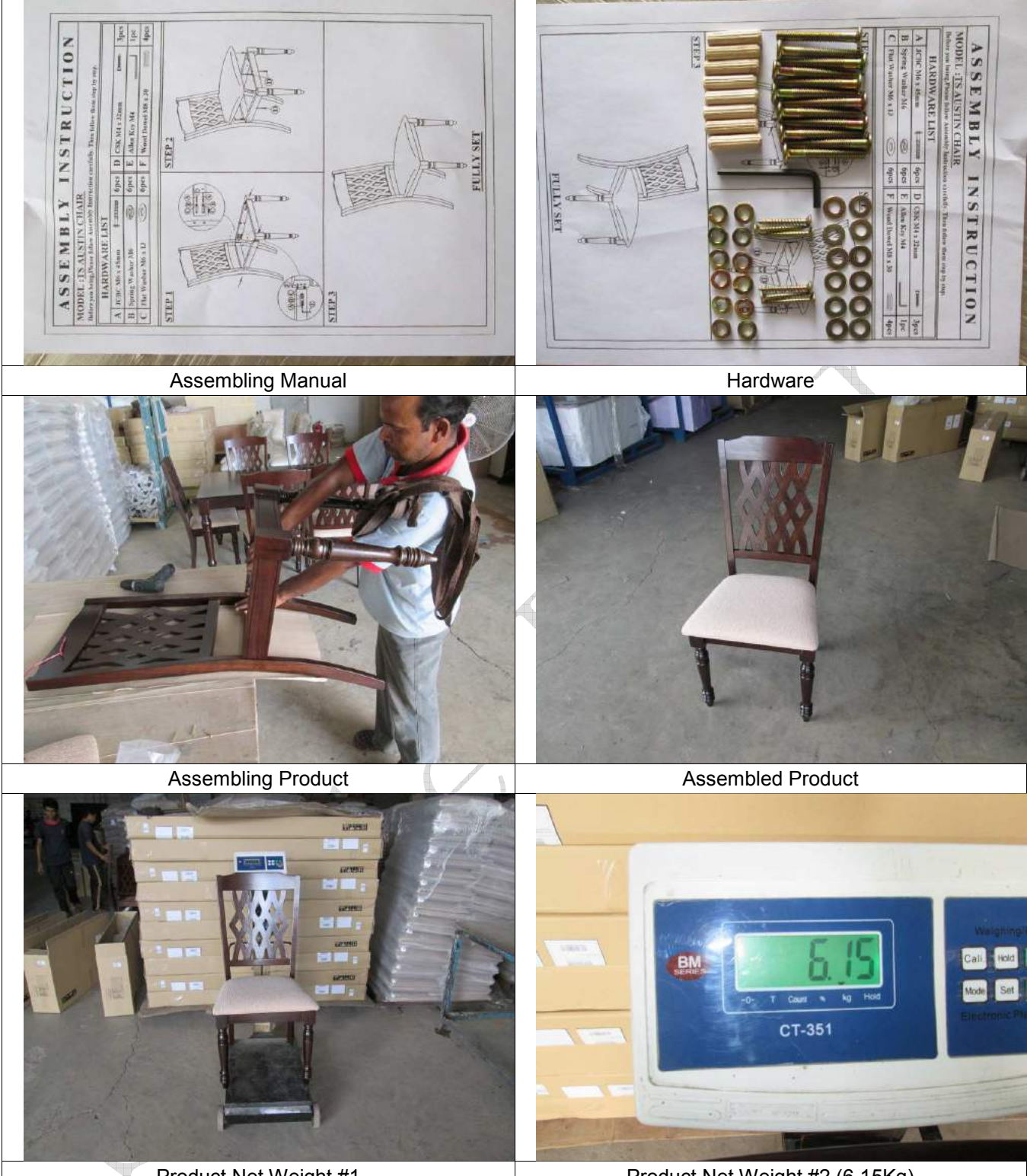
Product Net Weight #1