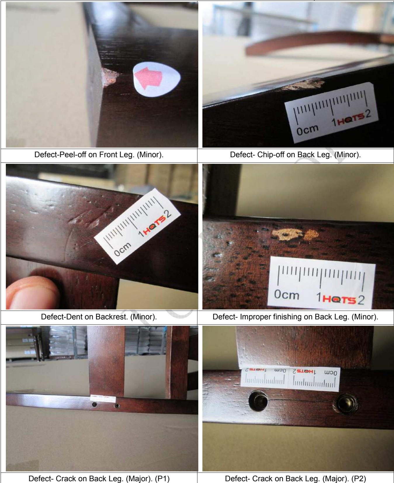
Report No: H-18012922